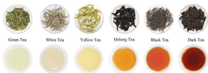
Figure 2. Various Camellia sinensis L. tea with different process (Zhu et al. , 2020).

The tea processing differentiates between tea and other types, such as the processing of dark tea and oolong tea. The primary step in processing dark tea is known to be microbial fermentation. The stacked rolling leaves should be kept for 24-40 hours in a room above 25°C during the microbial fermentation phase, the relative humidity (RH) of these leaves should be 85%, to initiate complex oxidation, condensation, and degradation of chemical tea components (Zheng et al. , 2015). Meanwhile, the oolong tea process commonly takes two days for traditional oolong tea processing, including leaf plucking, withering, zuoqing or bruising and withering, shaking or green-making, fixation or fixation de-greening (Granato et al. , 2014; Chen, Ding, Chen et al. , 2020). The variations in the related tea processing processes are described in Figure 2.