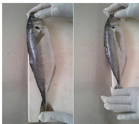
Figure 2. View for the studied species

For the study of the quality and quantity of the total fats of Caranx rhonchus in Mauritania, we used the following procedure: the fish was transported to the laboratory (Figure 2), sliced washed (cleaned) with cold water, eviscerated and filleted immediately. For this study, two samples for two species were selected (Table 1). The two samples were dried at 105 \pm 2^\circ\text{C} until reaching constant weight (Table 1) then crushed, minced and homogenized separately.