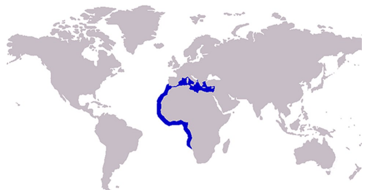
Figure 1. Distribution range colors indicate the degree of suitability of habitat which can be interpreted as probabilities of occurrence (Bauchot, 2003)

The Caranx rhonchus (or Decapterus rhonchus ), also known as Comète cossue (or Chinchard jaune ) in French, Jurel in Spanish and False scad (or false horse mackerel and or yellow horse mackerel) in English, is a species of medium-sized marine fish classified in the family Carangidae (Romero, 2002). It is distributed in the eastern Atlantic of Angola to Morocco including Mauritania along the African coast and reaching as far north as Spain in Europe, with its range also extending well into the Mediterranean Sea (Figure 1) (Bauchot, 2003). It is an opportunistic fish whose diet is characterized by a great diversity of species (Small fish and invertebrates). Distinguishing the species from members of Caranx rhonchus and horse mackerel is more difficult; the latter is also very widespread in Mauritania.