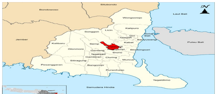
Figure 1. Map of Alasmalang. Alasmalang is located in Singojuruh Village, Banyuwangi, Indonesia. Alasmalang is marked with red colour.

One of the traditional ceremonies in Indonesia serving local meals in its procession is Kebo-keboan customary rite in Alasmalang. Kebo-keboan traditional ceremony is a village cleaning rite. The village cleaning ( bersih desa ) procession is a symbol of people's peaceful and harmonious life given by God the Only One (Dwiyanto, 2010). This traditional ceremony is held in Krajan village, Alasmalang Village, Banyuwangi, Indonesia. This area is a fertile one because Banyuwangi is well-known for its fertile soil (Prasetyo et al., 2018). It is this soil fertility that results in very abundant produce in Alasmalang. The map of Alasmalang village can be seen in Figure 1.