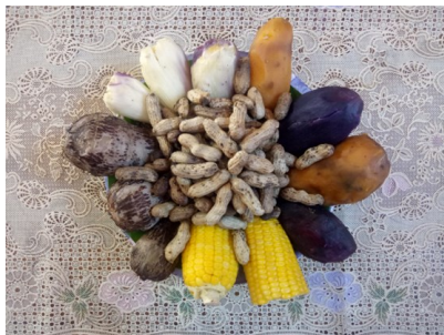
Figure 5. Boiled Produce in Kebo-keboan traditional ceremony. The boiled produce symbolizes produces is very abundant in Alasmalang village.

Kebo-keboan traditional ceremony procession in Alasmalang elicits local government officials such as regent, head of sub-district ( camat ), and head of the village, along with their rows. To welcome and to be familiar with them, some meals are served to them, including the village produces. The produces served are cassava, corn, purple edible tuber, and small potato ( kentang jembut ). All produce is served by boiling them without spice. This food symbolizes the abundant produce of Alasmalang village. The meals served by boiling them without spice are intended to be the purity of Alasmalang Village's farming products. The appearance of Boiled produces used in this work is shown in Figure 5.