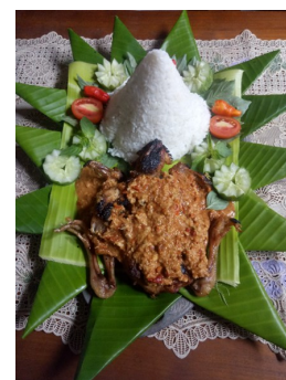
Figure 2. Pecel pitik . Pecel pitik is one of traditional food in Alasmalang, Banyuwangi made of chicken combined with serundeng .

Pecel pitik in Kebo-keboan traditional ceremony procession in Alasmalang, Banyuwangi is presented twice: in Barikan and Ijab Kabul . Barikan is a village ceremonial meal rite (Hefner, 1987). Barikan procession in Kebo-keboan traditional ceremony procession in Alasmalang was conducted on the day before the event. It was conducted after Ashar amid the intersection and along the roads of Krajan village, Alasmalang. The leader of tasyakuran is a religious leader. Meanwhile, Ijab Kabul is a procession before the beginning of Kebo-keboan traditional ceremony. Pecel pitik serving in Ijab Kabul procession is a meal for special guests such as regent, head of sub-district ( camat ), and head of the village, along with their rows. The appearance of Pecel Pitik used in this work is shown in Figure 2.