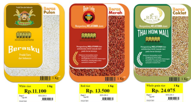
Figure 1. Some examples of rice labels used in the survey