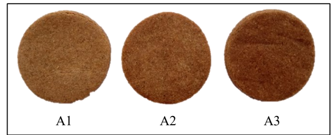
Figure 1. Gluten-free toddler biscuits

The second mixing process was carried out until it was even and smooths with the addition of palm oil as much as 27% and water as much as 13% of the total dry matter. Biscuits were made into sheets with a thickness of 0.4 cm and printed in a circle ( \varnothing = 5 cm) (Figure 1). Biscuits were baked in an electric oven at 140°C for 35 mins.