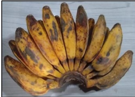
Figure 10. Kepok banana.

unique, in a way boiled or steamed without seasoning. This is done to maintain the authenticity and purity of the produce itself. Javanese people are used to processing crops for use in the tradition by boiling or steaming to maintain the purity of the produce (Pribadi et al. , 2021). The process of processing food by boiling or steaming leaves a distinctive taste which of course has been done by humans since ancient times.