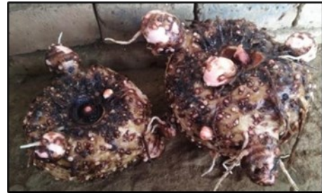
Figure 8. Elephant foot yam.

The next complementary material which is categorized as an underground plant is elephant foot yam. The part of the plant that is taken for the carnival is the tuber. Currently, elephant foot yam is still easy to find in some parts of Indonesia. Elephant foot yam is safe for consumption. The processing methods also vary, for example by steaming. Elephant foot yam tubers can be seen in Figure 8.