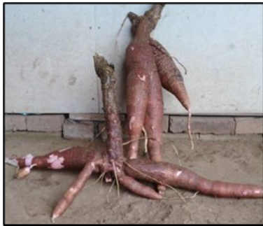
Figure 5. Cassava.

form of tubers that can be found in almost all parts of Indonesia. The produce used in this carnival is mostly in the form of food taken from the ground or referred to as underground plants (Jv: pala pendhem ). One of them is cassava. Cassava can be seen in Figure 5.