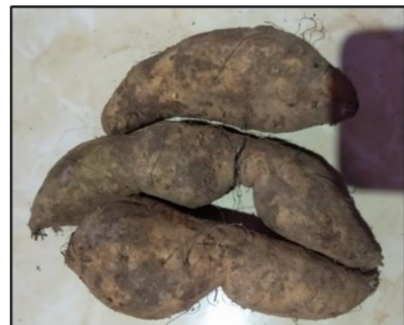
Figure 9. Sweet potato.

Sweet potato is also used as a complement in the Kirab Apem Sewu. The sweet potato part used in the carnival is the tuber. Sweet potatoes are easily found around the Sewu Village area. Sweet potato tubers can be seen in Figure 9.