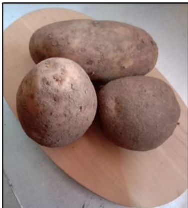
Figure 6. Potatoes.

The next complementary ingredient is potatoes. Potatoes are a popular underground tuber around the world, including in Indonesia. Potatoes themselves can be processed into a variety of foods. Potatoes can be seen in Figure 6.