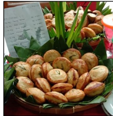
Figure 4. Apem cakes.

typical Javanese cake made from the main ingredient in the form of rice flour. The cake itself consists of two types: baked apem cake, which is processed by baking, and steamed apem cake, which is processed by steaming. The apem cake used in the Kirab Apem Sewu is the baked apem cake. Apem cake manufacturing must go through several processes that cannot be missed. Starting from the selection of apem cake ingredients to the packaging process. The apem cakes can be seen in Figure 4.