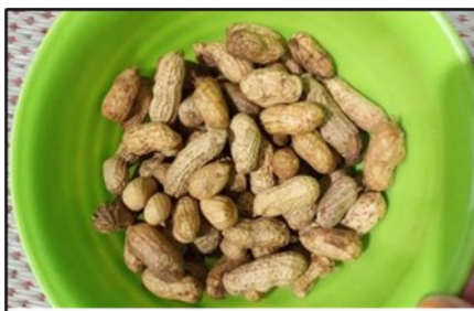
Figure 7. Peanuts.

Peanuts are also used as complementary ingredients in Kirab Apem Sewu. Peanuts are also included in underground plants. Peanuts are used as a complementary material for the carnival because it is an agricultural product that symbolizes soil fertility in Sewu Village. Peanuts can be seen in Figure 7.