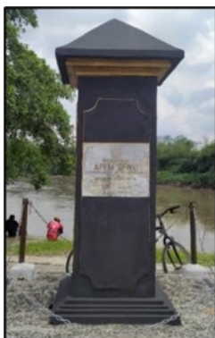
Figure 2. Apem Sewu inscription.

Every year in November, the Kirab Apem Sewu is held with various agendas. This carnival is held to attract both local and foreign tourists and, of course, preserve tradition. Even today, the inscription and monument of the Kirab Apem Sewu have been built on the banks of the Bengawan Solo River. The Apem Sewu inscription can be seen in Figure 2. Meanwhile, Kirab Apem Sewu monument can be seen in Figure 3.