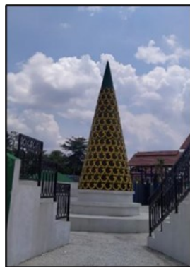
Figure 3. Kirab Apem Sewu monument.

As the name implies, the essence of this carnival lies in the apem cakes used in the carnival. Apem cake is a