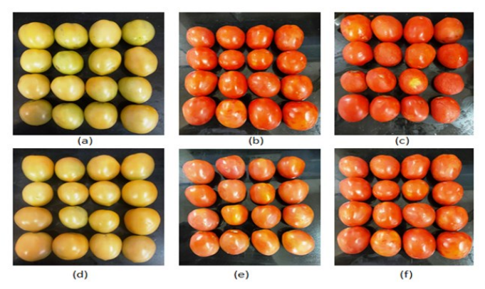
Figure 2. Effect of 1-MCP treatment on tomato fruits during storage. (a), (b) and (c) are the control samples at intervals of 1, 4 and 12 days respectively while (d), (e) and (f) are 1-MCP treated samples at intervals of 1, 24 and 34 days respectively.

Firmness or texture which was measured as gram force possessed major variations among all the treatments of control and treated samples. Moreover, 2.5 \mu L/L 1-MCP treated T<sub>4</sub> sample remained fit for consumption till the 34<sup>th</sup> day and also retained maximum firmness of the tomatoes as compared to the rest of the treatments as well as the control sample as shown in Figure 2. The firmness of the tomatoes treated with 1-MCP was significantly acceptable even on the last day of their shelf life.