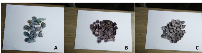
Figure 3. Photographic views of (A) fresh black turmeric (B) after Solar dried (C) after open sun-dried (Lakshmi et al., 2018)

drying air methods. The measured parameters showed that the L* and b* value decreased with both the drying methods and a* values was increased in solar-dried methods compare to open sun drying methods. The ΔE* values for fresh, solar dried and open sun-dried samples are 46.32, 42.33 and 33.12. It is observed that the ΔE* value of the sample dried in solar drying methods is higher than that of the sample dried in open sun drying methods. The photographic views of the black turmeric taken before and after drying are shown in Figure 3.