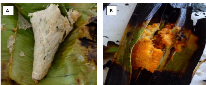
Figure 1. Fish-based product sold as street food. A) Satar and B) Otak-otak

Satar and otak-otak were chosen as popular fish-based street food products as shown in Figure 1. A total of 113 samples which consist of seventy-eight satar and